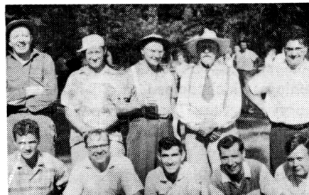
Give A Man Enough Rope —