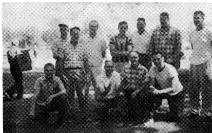
These Men Had "The Pull"

It was only because darkness came upon them that they gathered their things and reluctantly, but happily, departed for home.